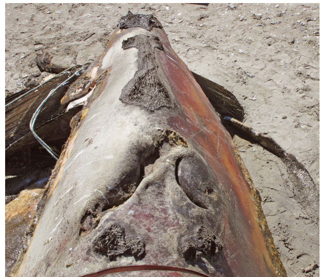
Fig. 5. Eubalaena glacialis . Case 11: Line impression resulting from chronic occlusion of the left nares of a North Atlantic right whale. Line embedded in multiple twists around the left baleen plates, exited the right mouth, crossed over the blowhole, and then wound tightly around the left flipper inducing a major periosteal proliferation around the radius and ulna.

1998, Pettis et al. 2004). For this reason, cyamid burden could be used to visually assess overall health in baleen whales (Pettis et al. 2004). Although cyamid burden was not reported for the majority of cases in our study, it was highly elevated in the 3 chronically entangled whales that sustained massive traumatic injuries from fishing line. Not only did cyamids cover most of the whales' skin surface, but they also concentrated in very high densities within the shelter of deep entanglement lacerations.