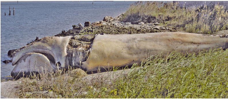
Fig. 4. Eubalaena glacialis . Case 8: Debilitating tissue damage in a North Atlantic right whale. Lines under marked tension were wrapped around each flipper insertion and across the dorsum and ventrum from flipper to flipper, incising down to the skeletal muscle on the back. The lines then moved caudally, flensing a large section of blubber.

animal (Case 10), lobster gear constricted the caudal peduncle and cut 19 cm into the soft tissue, severing 2 large superficial ventral arteries, which were presumed to be the site of fatal blood loss.