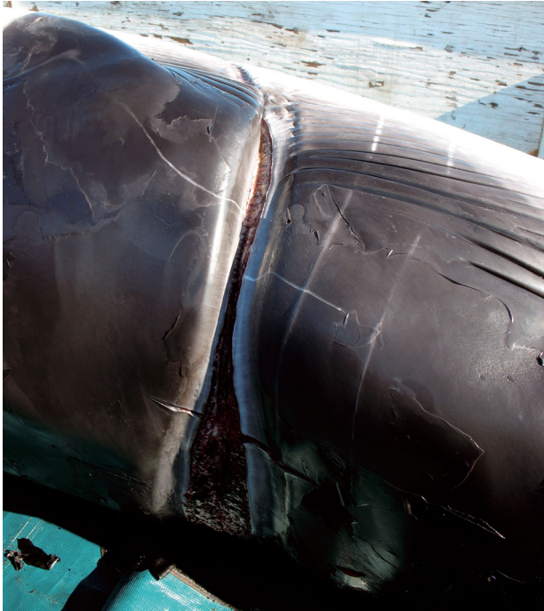
Fig. 3. Balaenoptera acutorostrata . Case 4: Minke whale with septicemia, following a line-induced necrotic laceration around two-thirds the girth anterior to the left flipper. Internally the animal had severe necrosuppurative bronchopneumonia and bacterial emboli in the brain, as well as liver and blubber atrophy

The progression to death due to systemic infection was characterized by the gradual weakening of immune defenses and the development of multiple