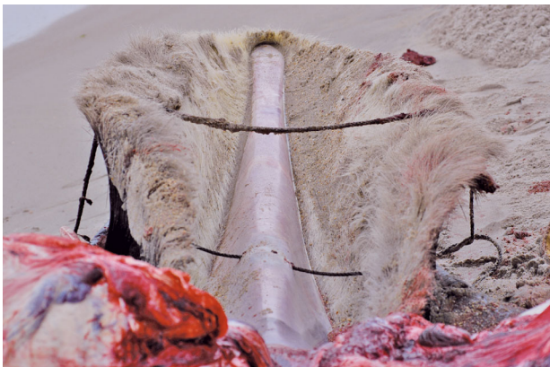
Fig. 2. Balaenoptera brydei . Case 6: Bryde's whale with impaired feeding. Line under great tension ran across and embedded in the mouth, penetrating the midline bones of the rostrum. It was concluded that this animal died from debilitation and impaired foraging leading to starvation due to chronic entanglement.

In light of our findings and the presence of such complex feeding adaptations in baleen whales, we suggest that oral entanglement may pose one of the greatest threats to survival in entangled baleen whales. Not only did oral entanglement occur in 64% of all lethally entangled whales that we examined, but it directly led to the demise of at least 3 animals, due to impaired foraging and possibly loss of function of the hydrostatic seal. Gear in or around the mouth would almost certainly lead to some degree of nutritional stress, leaving animals in a more vulnerable state of health and, thus, increasing the risk of mortality. The survival of Critically Endangered NARWs may be more severely threatened by mouth entanglement, as this species is particularly prone to contacting gear with its mouth (Johnson et al. 2005), given that it tends to swim open-mouthed for long periods when feeding. Attempts to remove gear attached to the mouth by human disentanglement teams have proved to be very challenging, since the head is the least accessible area on the whale's body. However, Moore et al. (2010) describe a technique to sedate whales at sea in order to facilitate removal of gear from the mouth in baleen whales.