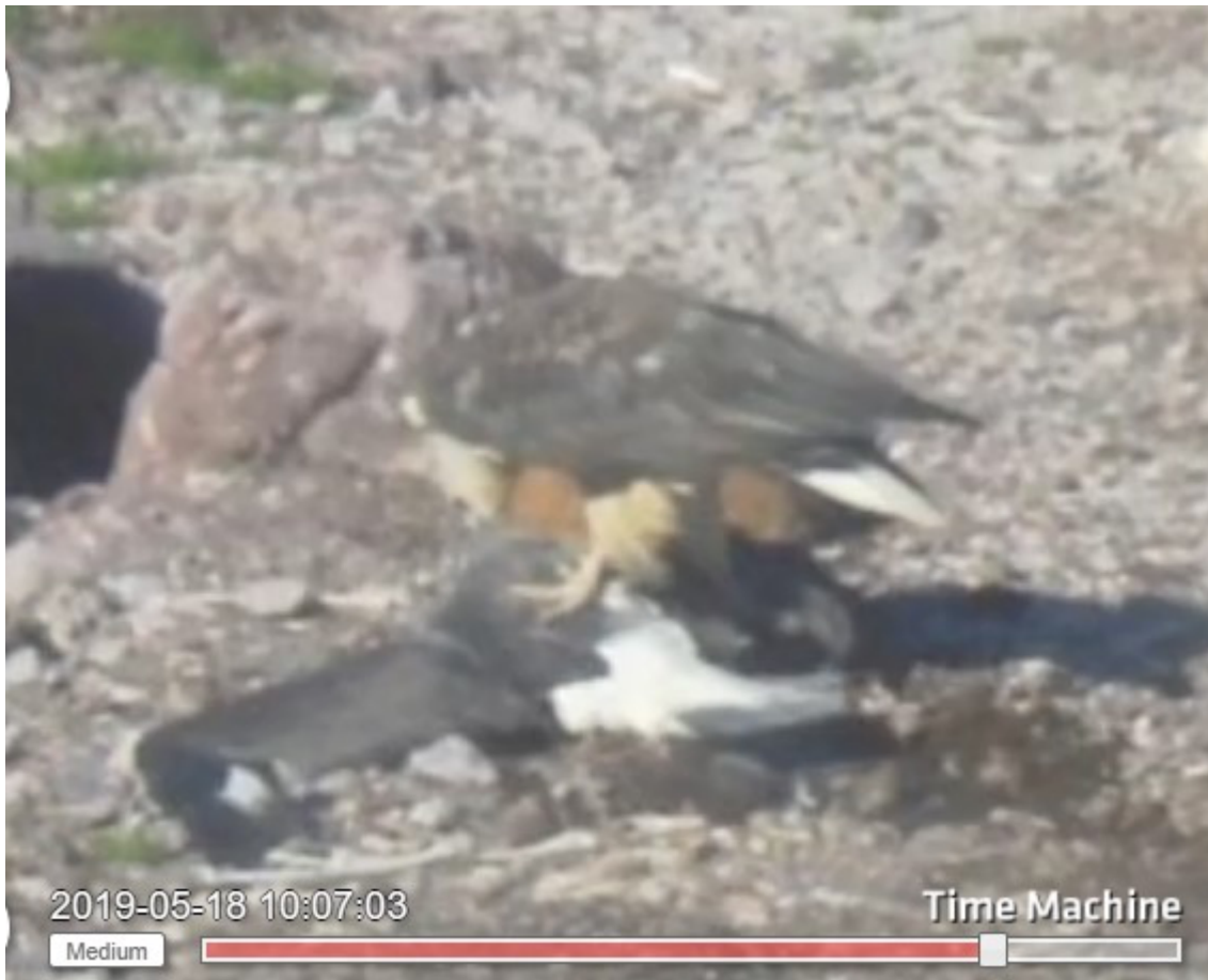
Figure S1. Scavenging of dead shy albatross chick by suspected juvenile white-bellied sea eagle captured by CRAGS remote camera.

The only known predators of shy albatross on Albatross Island are native, white-bellied sea eagles ( Haliaeetus leucogaster ) which on rare occasions have been observed scavenging deceased chicks (Figure S1.1). However, no live predation has been observed and it is not considered a likely significant cause of mortality for shy albatross on Albatross Island.