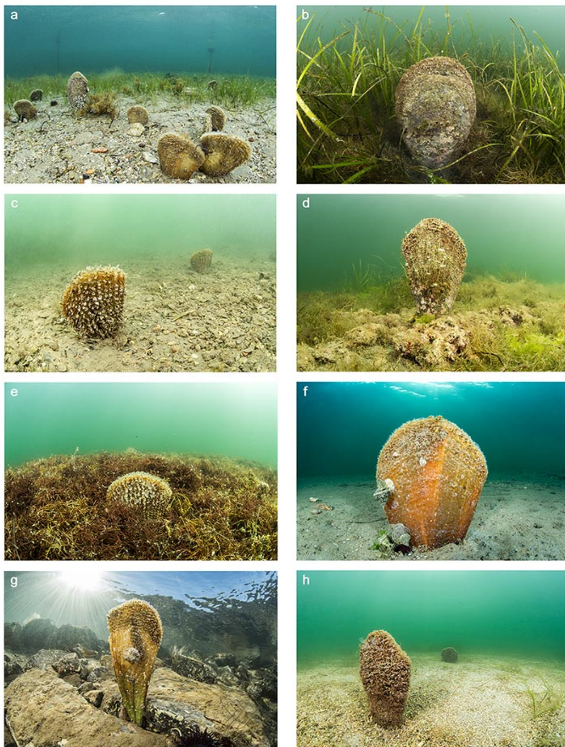
Fig. S1. Pinna nobilis settled within different habitats in the Thau lagoon: (a) Pebbles, sand and Z. noltei meadow, (b) Z. marina meadow, (c) Mud and shell debris, (d) Soft-rock ( Pholas dactylus habitat), (e) Seaweed carpet (mainly composed of the red algae Gracilaria sp.), (f) Sand and mud, (g) Riprap blocks, (h) Sand and shell debris